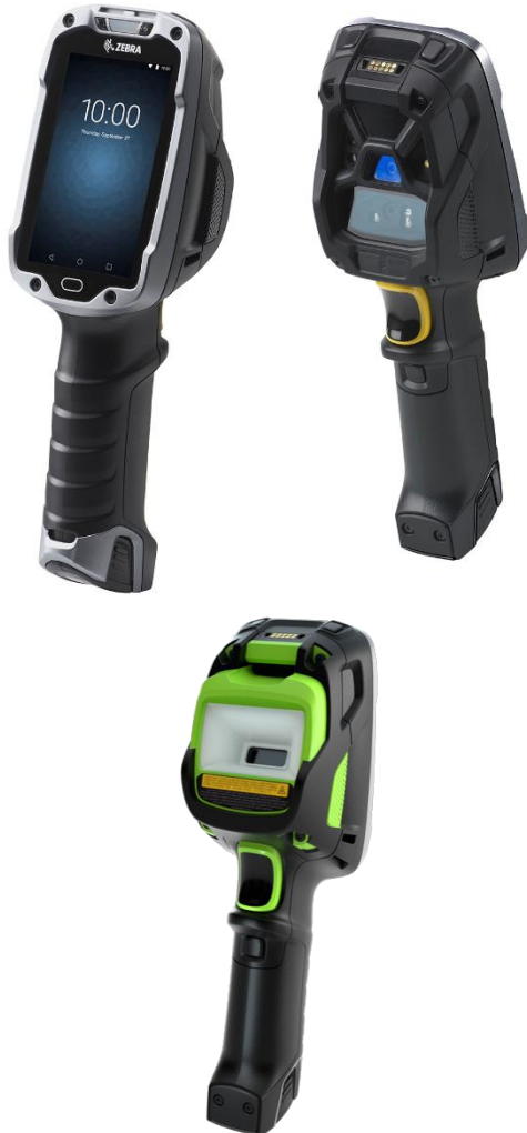
TC8300 DPM w/ light diffusion *