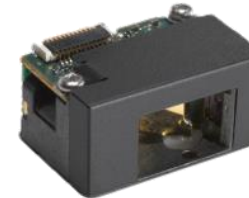
TC8XXX-A 1D Standard Range Laser