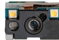
TC8XXX-2 Medium Range Imager