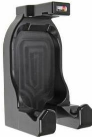
MNT-TC8X-FH-01 TC8XXX Forklift Holder