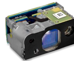
TC8XXX-3 Extended Range Imager