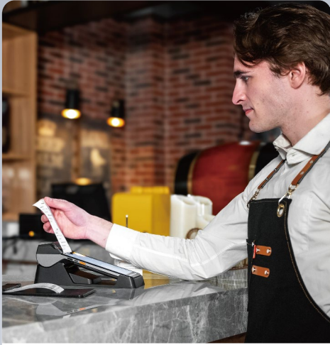
Delivery Order Management